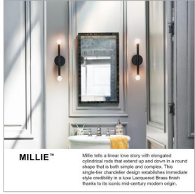
MILLIE™ Millie tells a linear love story with elongated cylindrical rods that extend up and down in a round shape that is both simple and complex. This single-tier chandelier design establishes immediate style credibility in a sleek Lacquered Brass finish thanks to its iconic mid-century modern origin.